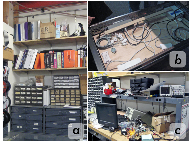
Figure 1: The Exploratorium Museum in San Francisco, California, where all exhibits are created in-house. Exhibit designers are responsible for all phases of development: designing interactions, constructing physical components, and developing software. They are jacks-of-all-trades, their work environment (a,c) filled with computers, electronics equipment, and manuals for a diverse set of software. A typical exhibit (b) comprises many off-the-shelf components hooked together using high-level languages such as Adobe Flash.

Copyright 2008 ACM 978-1-60558-034-0/08/05 ...$5.00.